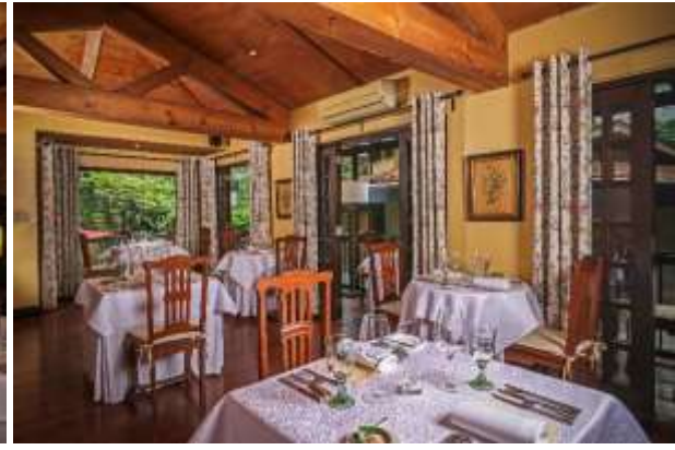
Main Dining Room