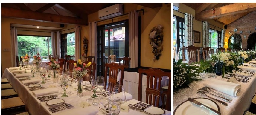
Main Dining Room